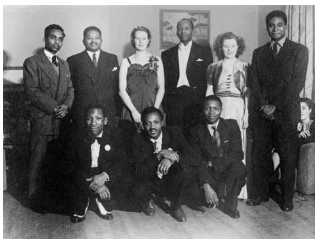
Executive Committee of the Birmingham Afro-Caribbean Organisation, 1950s [MS 2165]

We would like to hear from other people who were involved in the organisation or have information.