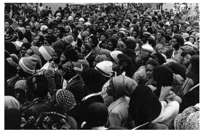
African Liberation Day, Handsworth Park, 1977.

"This is us, this is me. There's nothing bigger than the work that I do, because it is important. We have been so... demoralised through the visual, and other, representations over the years that the least you can do is try to show something that gives a fairer representation of the average person's contribution."