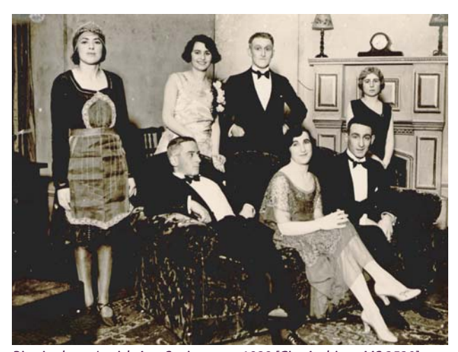
Birmingham Jewish Arts Society cast, 1929

This learning resource is aimed at a wide range of users and is arranged into two case studies - Jewish History in Birmingham and Late 20th Century Birmingham . There is also a list of useful books, sources and websites to get you started on your own research.