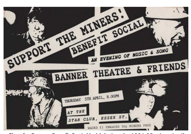
Flyer for Banner Benefit Social held during the 1984-85 miners' strike

This collection also charts the creative processes involved in turning research notes and recordings into performances that meet Banner's slogan of 'Entertainment for a Change'. It is a rich resource for anyone interested in artistic, social and political concerns in late 20th century Birmingham and Britain. Banner Theatre is still an active theatre company and regularly performs across the UK.