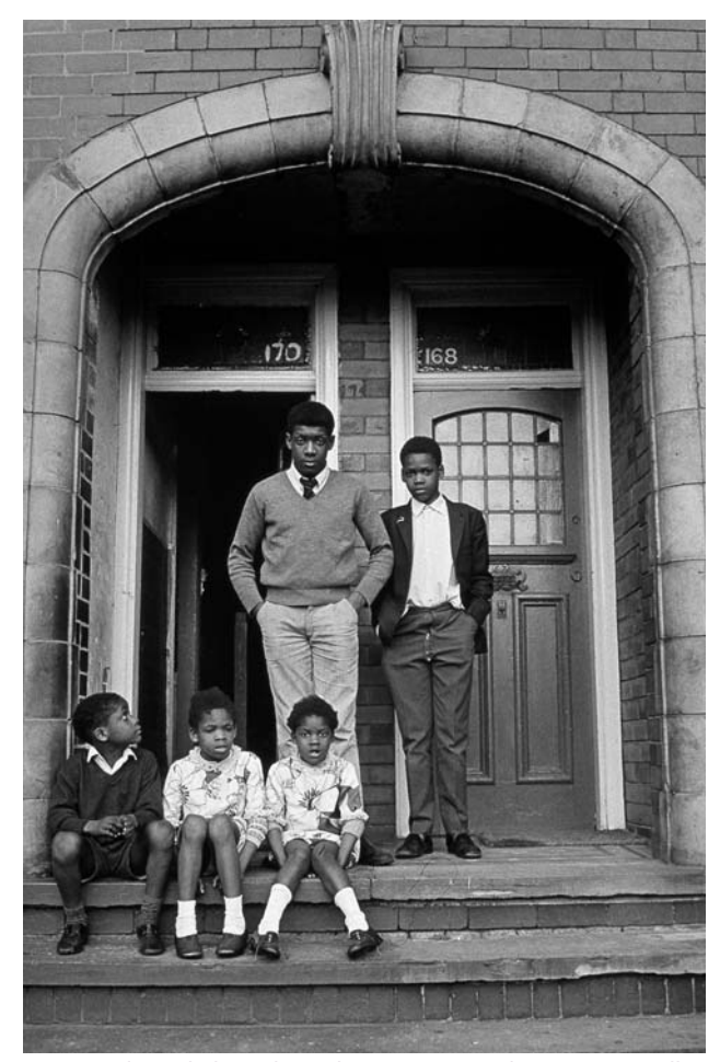
'Handsworth through Southern Eyes', 1971.

Fighting Prejudice focuses on the 1930s and 1940s and Birmingham's connections to the Holocaust and refugee relief in that period.