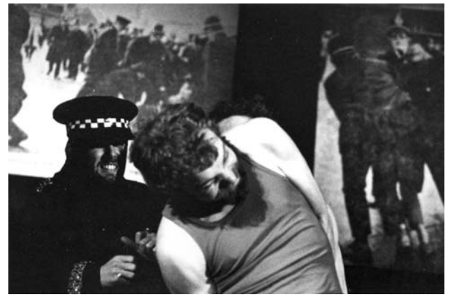
Banner Theatre multi-media production [MS 1611]