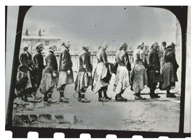
One of Banner Theatre's many slides used for performance backdrops

'Actuality' based productions are multi-media in format, where photographic slides and taped extracts of interviews underline dramatic points within the scripted performances. These images and recordings are selected from the fruits of extensive research into the chosen subject and frequently give a voice to otherwise dispossessed and marginalised individuals and communities.