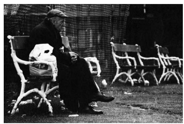
'Sundays are bloody awful,' 1980s.

Migration as a Way of Life explores the history of homelessness in Birmingham and the city's travelling communities for whom migration is a fundamental part of their identity.