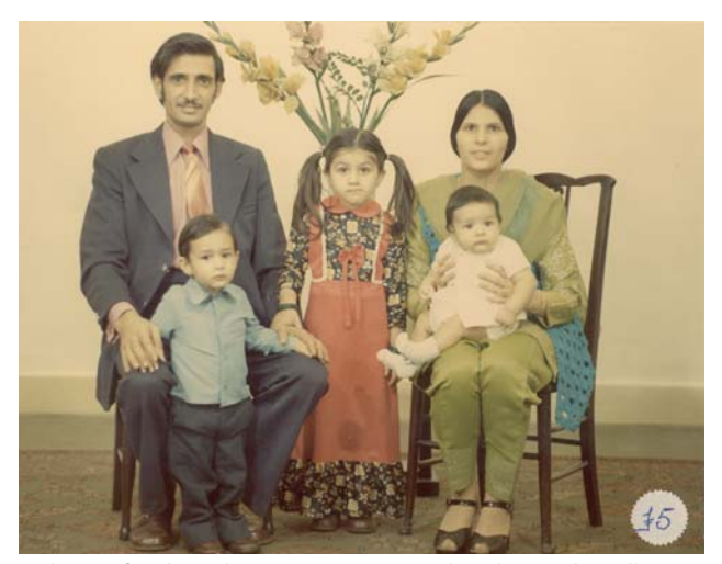
Unknown family studio portrait, 1970s