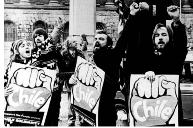
Banner protest in support of the Chile Solidarity Campaign, 1970s

Banner Theatre campaigns on a host of social justice issues, including refugee rights and industrial relations matters. The records reflect this broad interest and also the multi-media approach to performances. Research notes include transcripts of recorded interviews with a range of people, dealing with many issues that have faced communities across Britain and beyond over the past thirty years. Yorkshire miners, Indonesian shoemakers, Chilean political refugees, and Birmingham environmental campaigners are just some of the many groups given a voice in this collection.