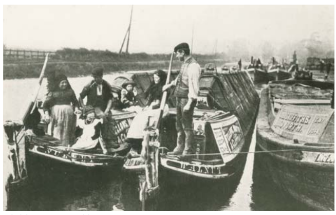
Children on canal boats, c.1911 [WK/B11/5434]

canal women, schooling was made compulsory for these children. However it was still possible to get around the system, and in 1952 a 12 year old girl who had never attended school was found working on the canal.