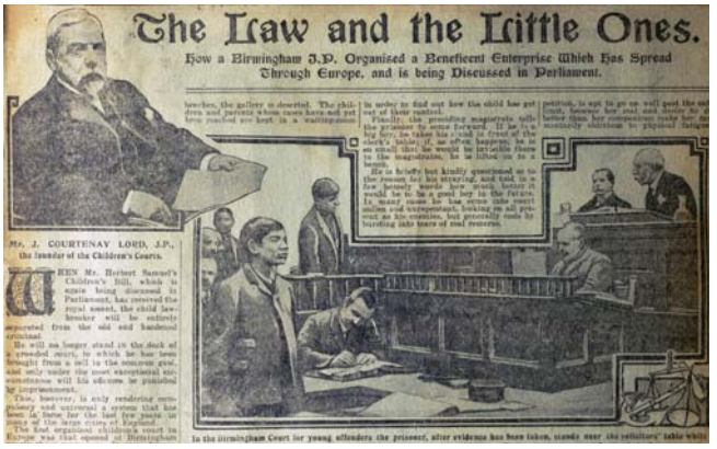
Birmingham School Board newscutting on children's session [SB B/1/11]

as magistrates – until 1919 only men were eligible – and subsequently became recognised nationally as an expert on young offenders. The ceremonial key showed the figure of Justice, unveiled and without a sword, reflecting Geraldine's belief in justice with understanding.