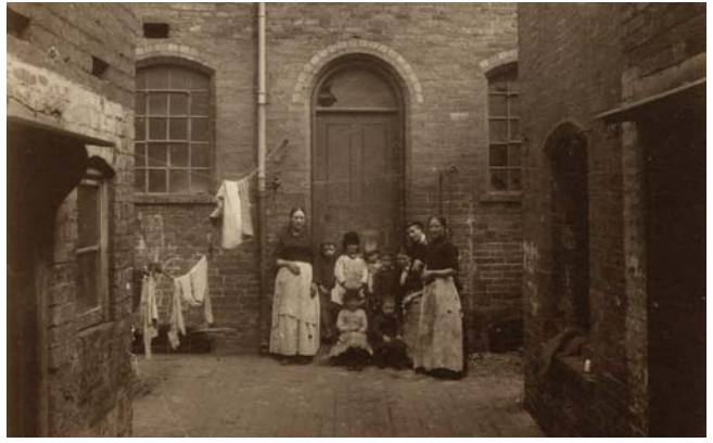
Rear of 12-13 Upper Priory, 1875 [Improvement Scheme Photo 115a]

On the other hand many working class children loved the freedom that they had playing outside in the back-to-back courts and streets, far more freedom than that allowed to more materially privileged middle-class children.