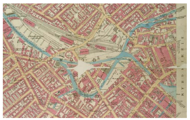
Ordnance Survey 25" map showing part of Ladywood, 1887 [F8 /1st ed.]

poor homes and would often be absent due to illness, bad weather, truancy and seasonal work. Girls were often kept home to look after younger children. Oozells Street Board School is now one of the few remaining 19th Century buildings in Brindley Place and is home to the Ikon Gallery.