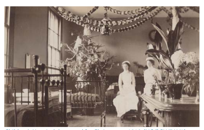
Children's Hospital decorated for Christmas, c.1910 [HC/BCH/7/6/1]

Tuberculosis, from Birmingham to his house in Davos, Switzerland. The first party of 30 children arrived in 1932, to recover in the clean mountain air. A blue plaque above the Santander bank now marks where the factory once stood.