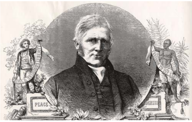
Engraving of Joseph Sturge [Birmingham Portraits]

The statue shows Sturge with his hand resting on a Bible, whilst below him are two female figures - 'Peace', and 'Charity' who is shown nurturing a child symbolising the emancipated slave.